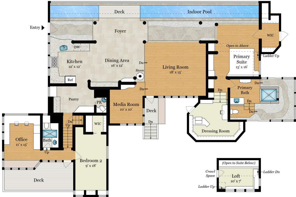
MAIN RESIDENCE MAIN LEVEL 2,275 SQ FT