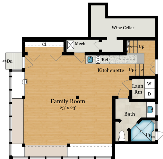
MAIN RESIDENCE LOWER LEVEL 860 SQ FT